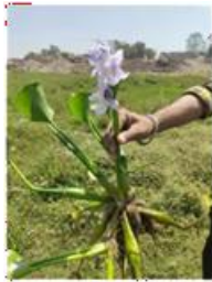
Fig.2 Sample Collection

Industrial wastewater used in this study was collected from SunStar Pvt. Ltd., Shirpur. The collected wastewater contained dissolved solids, organic pollutants, oil and grease, and nutrient compounds typically present in industrial effluents. Before treatment, the wastewater was visually inspected and stored in clean containers for experimental use.