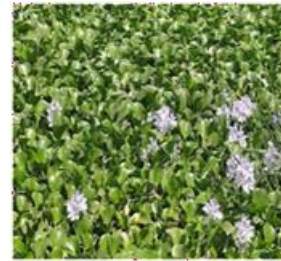
Fig.1 Water Hyacinth

Phytoremediation is an emerging natural treatment method that uses plants to remove contaminants from water. Among aquatic plants, water hyacinth ( Eichhornia crassipes ) has gained attention due to its rapid growth rate, extensive root system, and high pollutant uptake capacity. Although it is considered an invasive species, its ability to remove organic matter, nutrients, and heavy metals makes it suitable for wastewater treatment applications.