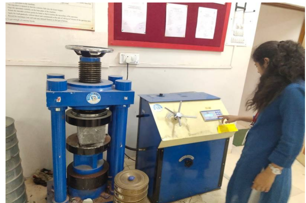
Fig.3.4 Compressive test under CTM