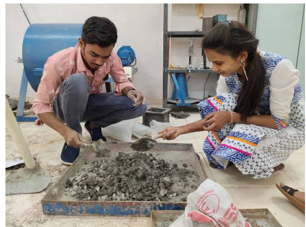
Fig.3.1 Mixing of Ingredient