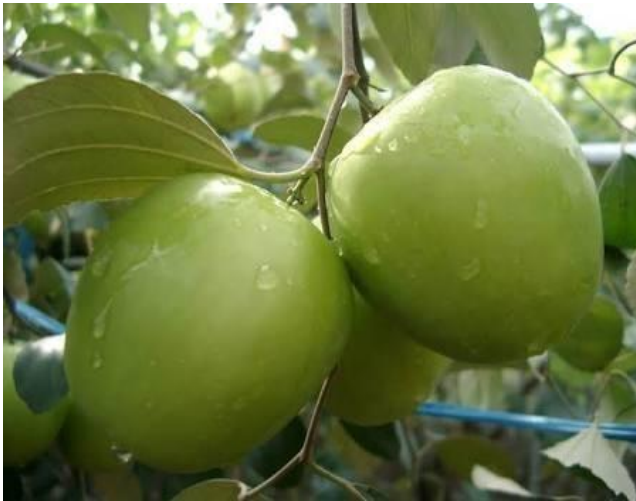
Fig 4. Jjoba

Jjoba oil replenishes lost nutrients and returns the pH balance of skin and hair to its normal state.