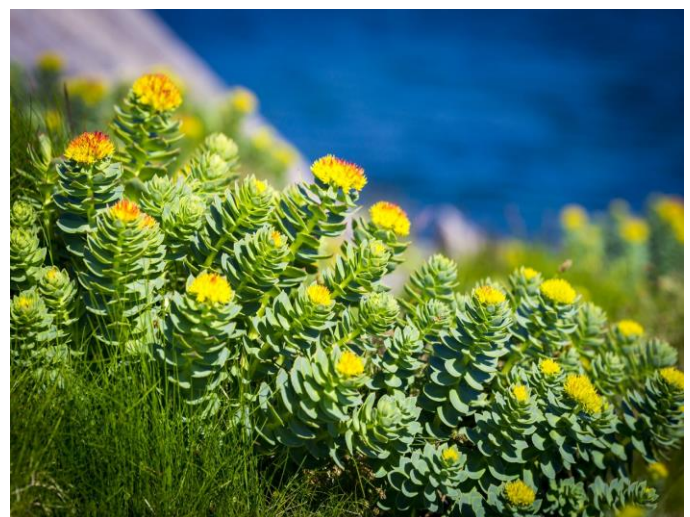
Fig 7. Rhodiola rosea-Rhodiola rosea:

It is also referred to as roseroot, arctic root, king's crown, lignum rhodium , orpin rose, and golden root. It is a species of plant from the Crassulaceae family that lives in frigid climates. Traditional folk medicine used R. rosea to increase physical endurance, work productivity, longevity, resistance to high altitude sickness, and to treat fatigue, depression, anaemia, impotence, gastrointestinal disorders, infections, and nervous system disorders. It grows primarily in dry sandy ground at high altitudes in the arctic regions of Europe and Asia. Phenolic chemicals, which are known to have potent antioxidant capabilities, are abundant in R. rosea .