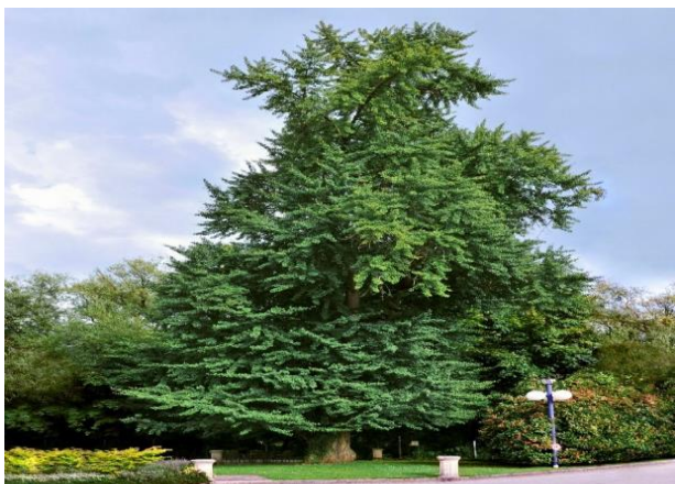
Fig 9. Ginkgo

Ginkgo: The leaves and nuts of the Ginkgo biloba ( G. biloba ) tree have been used for thousands of years in China and Japan to cure a variety of medical ailments, such as impotence in men and poor blood circulation, hypertension, poor memory, and depression. It is also establishing a similar reputation as an anti-inflammatory and antioxidant. Ginkgo biloba is a member of the very sized Ginkgoaceae family. The flavone glycosides found in the G. biloba extract EGb 761, which is made from the tree's leaves, are mostly derivatives of quercetin and kaempferol (33%), and terpenes (6%), which have demonstrated the ability to be isolated from the leaves of L. inermis and have demonstrated a significant antifungal antibiotic effect.