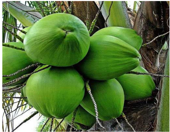
Fig 2. Coconut

Coconut oil: The dried kernel of copra, which contains 60–65% oil, is crushed to create it. Lower chain fatty acid glycerides are abundant in coconut oil. Coconut oil is made from the fruit or seed of the Arecaceae -family coconut palm tree Cocos nucifera . Since coconut oil is easily usable in liquid or solid form and has a melting point of 24 to 25°C (75-76°F), it is frequently used in baking and cooking. Coconut oil does wonders to soften and hydrate the skin.