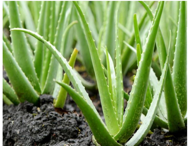
Fig 6. Alovera

properties, vitamins A, C, E, and B, choline, folic acid, and vitamins B12 and B12 that have antioxidant properties [36].