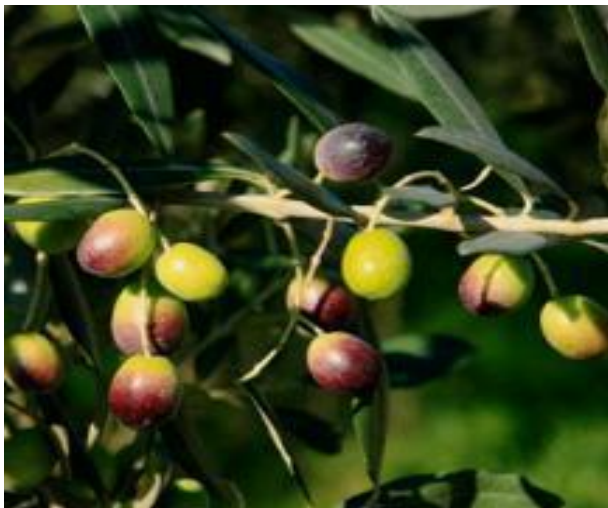
Fig 5. Olive

Olive oil: It is a fixed oil made from the fruits of the Olea europaea plant, which belongs to the Oleaceae family. Trilinolein, triolein, tripalmitin, tristearate, monostearate, triarachidin, squalene, -sitosterol, and tocopherol are the main components. In cosmetics like lotions, shampoos, and other products, it serves as a skin and hair conditioner. It is a strong promoter of fatty acid penetration.