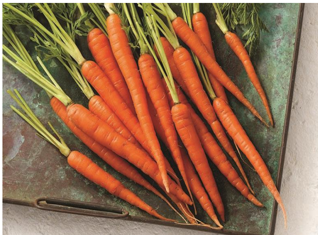
Fig 8. Carrot

Carrot: It is obtained from the plant Daucus carota belonging to family Apiaceae. It is a valuable herb since ages as due to its richness in Vitamin A along with other essential vitamins. Carrot seed oil is used as anti-aging, revitalizing and rejuvenating agent. The carrot gets its characteristic and bright orange colour from \beta -carotene, and lesser amounts of \alpha -carotene and \gamma -carotene. \alpha and \beta -carotenes are partly metabolized into vitamin A in humans [37].