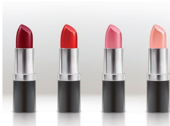
Figure 1 – Shades of lipsticks

In some cases, customers may experience injury if they regularly use synthetic items that contain ingredients like lead, petrolatum, and phthalates. These products may irritate the lips, leave them dry and chapped, and increase your risk of developing allergies, asthma, and cancer [10].