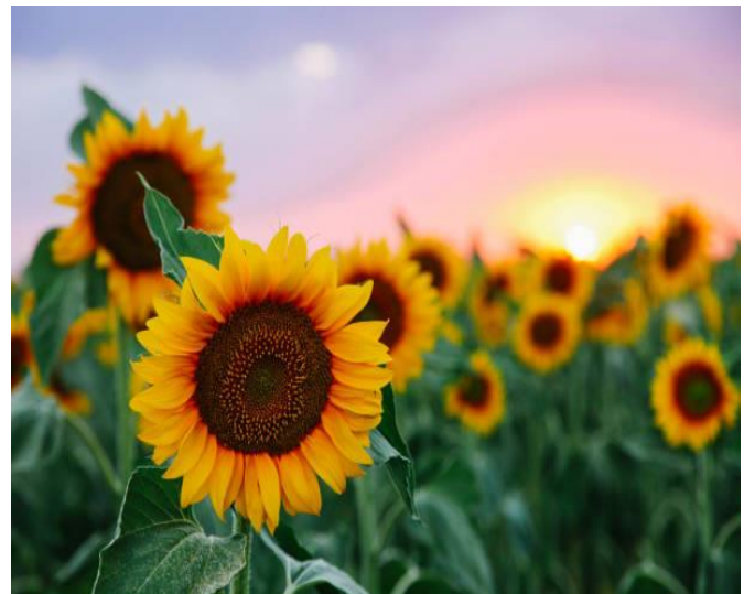
Fig 3. Sunflower

Sunflower oil: is a non-volatile oil derived from the seeds of Helianthus annuus , a member of the Asteraceae family. Lecithin, tocopherols, carotenoids, and waxes are all present in sunflower oil. It is non-comedogenic and has smoothing qualities. A straightforward yet affordable oil that has stood the test of time in a variety of emulsions designed for face and body products.