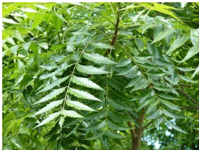
Fig 10. Neem

Neem: Neem or Margosa is a botanical relative of mahogany. It belongs to the family Meliaceae. The Latinized name of Neem Azadirachta indica is derived from the Persian. Azad=Free, dirakht=Tree, i-Hind=of Indian Origin. The common treatment for the dandruff is Neem as it produces antifungal, antibacterial, pain-relieving, and anti-compounds that would treat dandruff [38].