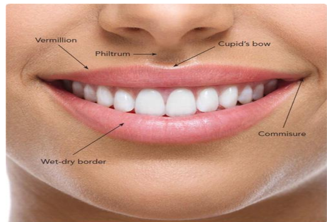
Fig 11. Anatomy Of Lip

nerve supplying the lower lip is derived from the mental foramen and sends large twigs to the mucous membrane, the integument, and the fascia of the lip and chin. Some of the lymphatic vessels of the lips pass to a gland just above the body of the hyoid bone, while others pass to the submaxillary glands. The labial glands are in the submucosal layer of the lips around the orifice of the mouth. They secrete a mucous fluid. Mucous retention cysts develop when the ducts of these glands become occluded [30,31].