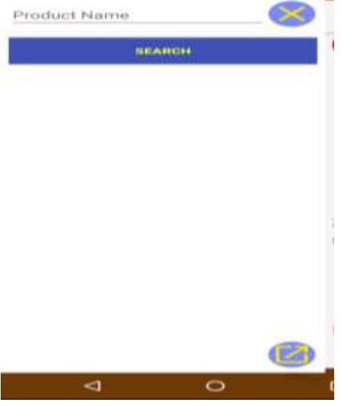
Figure 3. Home page