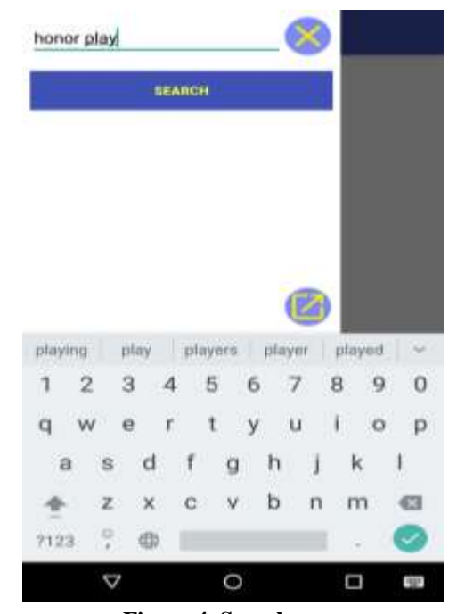
Figure 4. Search page