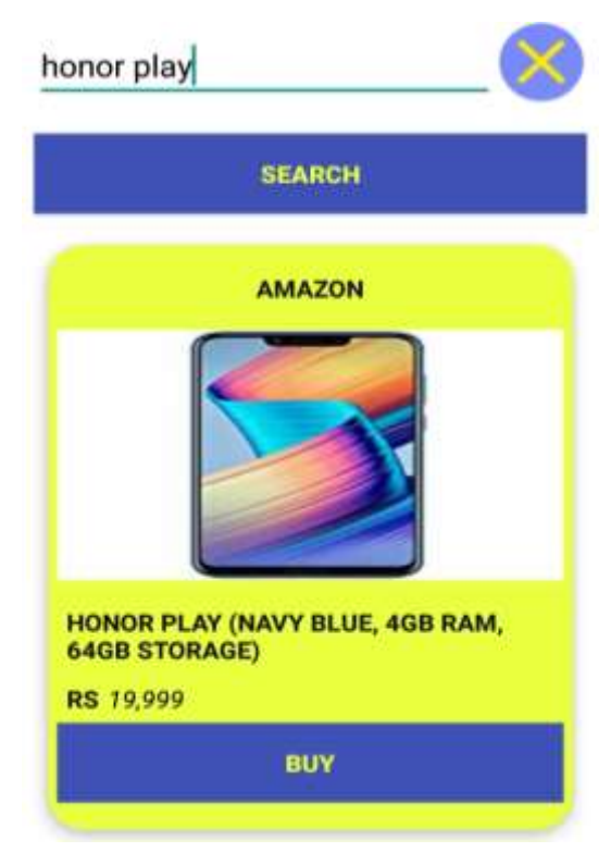
Figure 5. Product display page