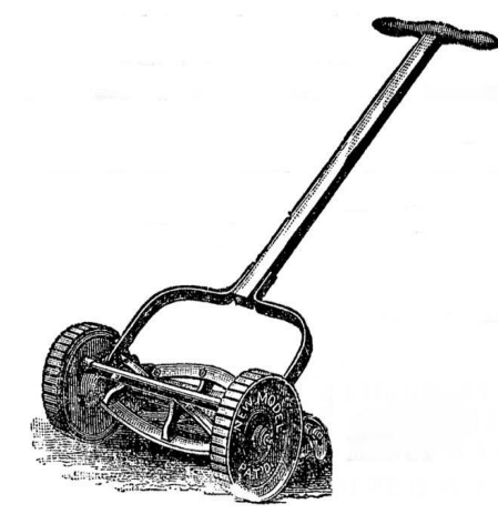
Fig Conventional grass cutter

charge the battery. As the solar panels are used to charge the batteries no external charging is required. The grass cutter and vehicle motors are interfaced to an 8051 microcontroller. The microcontroller used controls the working of all the motors. The microcontroller is coded with an embedded C programming language. It is also interfaced to an ultrasonic sensor for object detection. The microcontroller moves the vehicle motors in forward direction in case no obstacles. On obstacle detection by ultrasonic sensor, monitors it and the microcontroller thus stops the grass cuter motor. This avoid any damage to the object/human/animal. Microcontroller then turns the robotic vehicle off until it gets clear of the object and then moves the grass cutter in forward direction again.