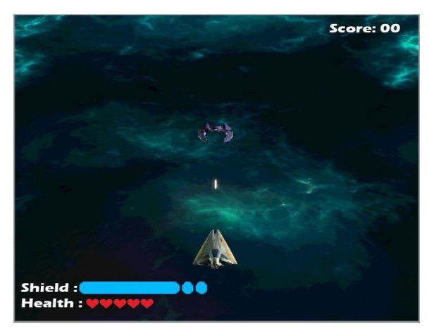
Fig 11: Screenshot during a gameplay