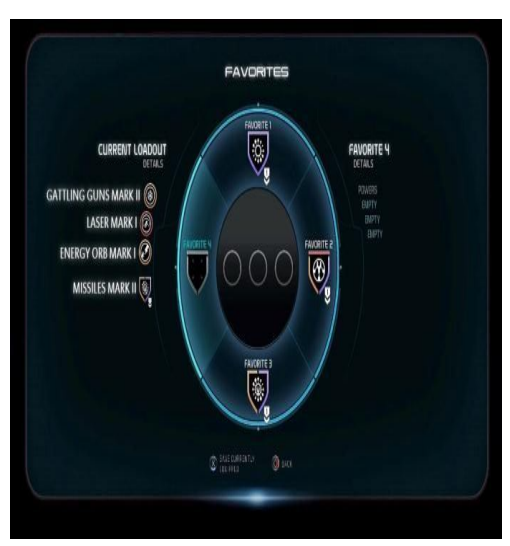
Fig 13: Weapons selection and favorites menu