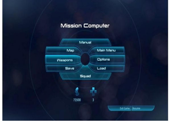
Fig 12: Pause Menu