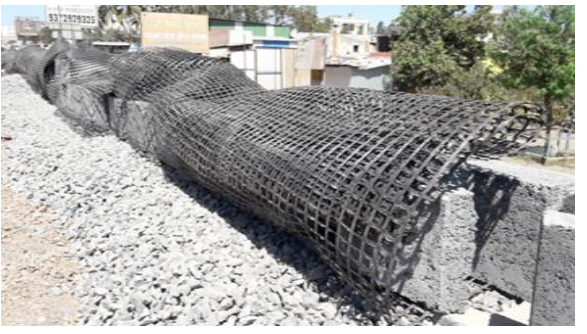
Fig 1 Geogrid

through of surrounding soil, stone, or other geotechnical material." Extruding and drawing sheets of Polyethylene (PE) or Polypropylene (PP) plastic in 1 or 2 directions or weaving and knitting Polyester (PET) ribs are methods used to generate geogrids