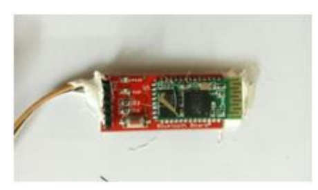
C-05 Bluetooth Module

Bluetooth devices use the ISM band around 2.4 GHz. This can be used worldwide, without the need to pay license fees, but many other devices like DECT telephones (wireless phones), smart tags with RFID, baby phones use it too. Bluetooth uses the same bands as some WLANs, but the modulation technique is different.