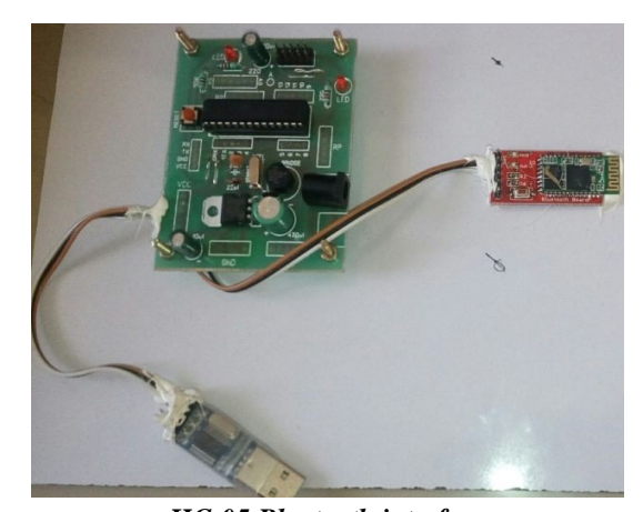
HC-05 Bluetooth interface

This project was designed to provide a user friendly communication system for deaf, dumb and blind people travelling by airplanes using Bluetooth technology. In our project we are using HC-05 Bluetooth module.