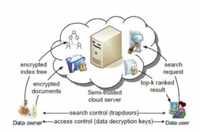
Fig.1 Architecture And Key Datastructure