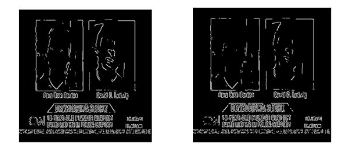
Fig. 3: (a) Original Canny Image Fig. 3

In this stage we first apply canny edge detector to identify the edges in the image. We then select edges of the image by taking the intersection of the binarized information of the enhanced gradient image with the edge map. The original canny edge image and the selected edge image are shown in Figure 3