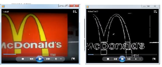
Fig 5 Result 2