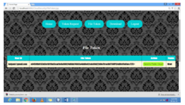
Fig: File token response from private cloud to user