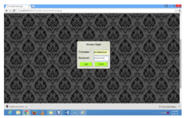
Fig: Private cloud login