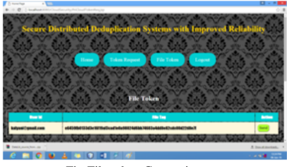
Fig:File token Generation req