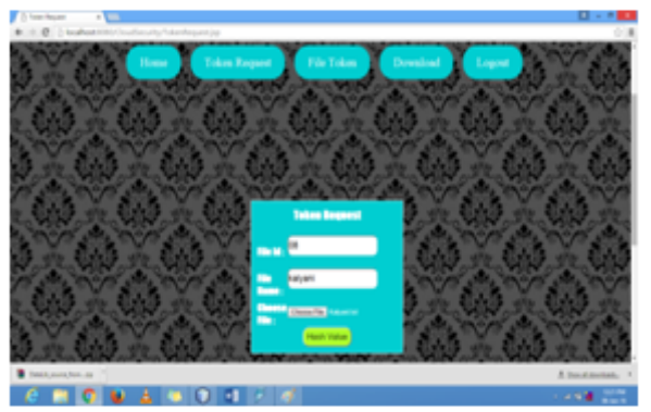
Fig: Token req