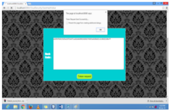
Fig: Token generation